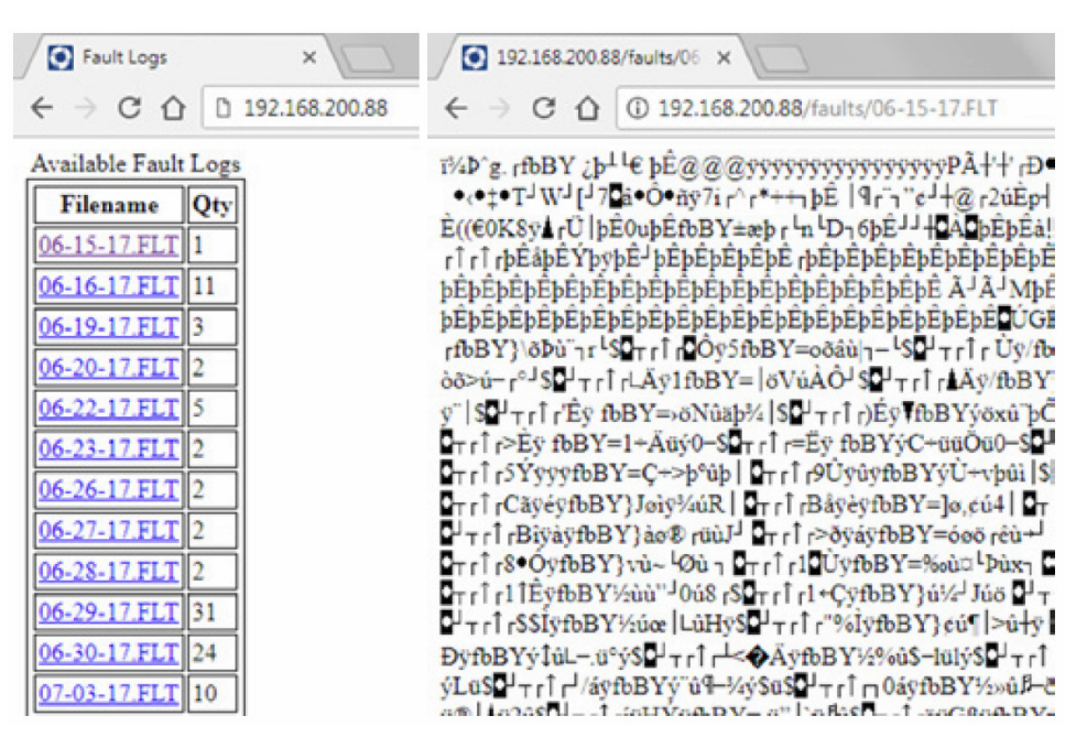
Figure 1. Black Box Fault Data File Access